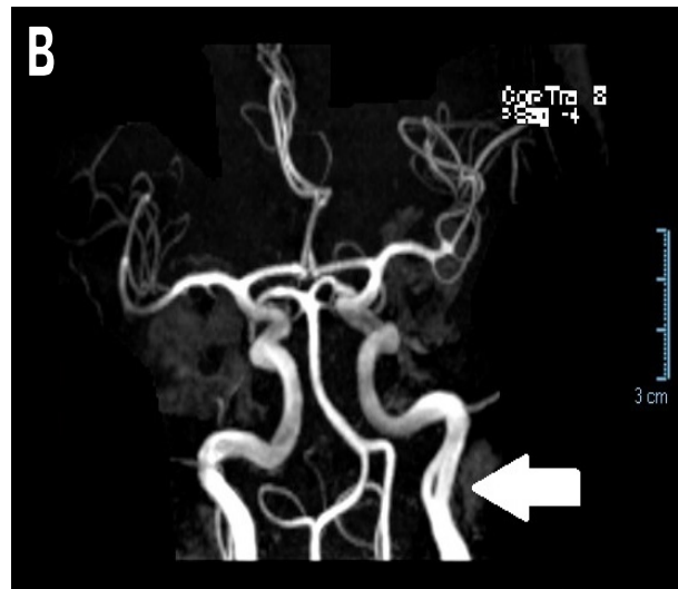
Figure 1. A and B) Cervical arterial resonance angiography demonstrates dissection in the left carotid artery in the C1/C2 segment.

For the treatment of arterial dissection, acetylsalicylic acid and atorvastatin were used. For the treatment of headache, indomethacin (50 mg every 8 hours) was initiated orally, with a significant pain response in only 3 days. The patient became asymptomatic. He took indomethacin for 15 days.