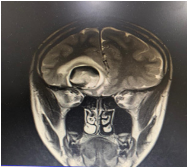
Figure 2. Magnetic resonance imaging of the brain showing Zabramski cavernoma 1.