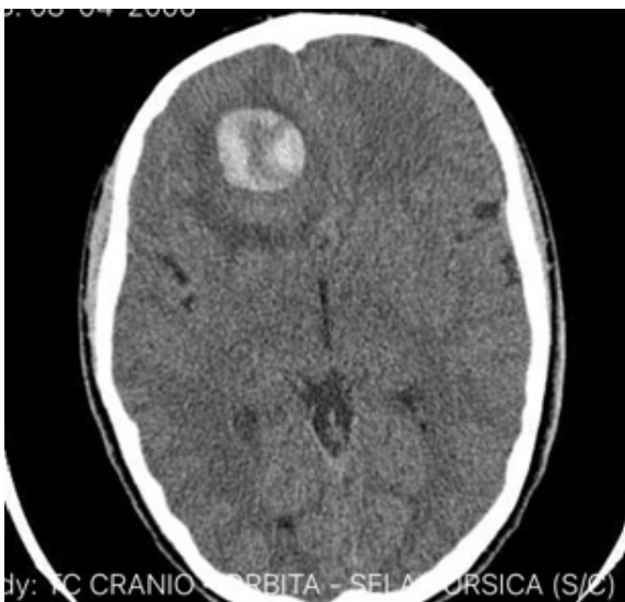
Figure 1. Entry CT scan showing right frontal cavernoma.

The patient was previously healthy, was not taking any medication continuously, and had never undergone any surgical procedures. The mother reported that during intrauterine life, the patient developed only one umbilical artery, and that he was followed by a neurosurgeon during the first four years of life, due to an above average brain girth. As he never manifested any neurological symptoms, he was discharged. She also informed that her son had suffered two head traumas throughout his life, both in the frontal region of the skull, the last one three years prior to the report. Both accidents did not cause major repercussions.