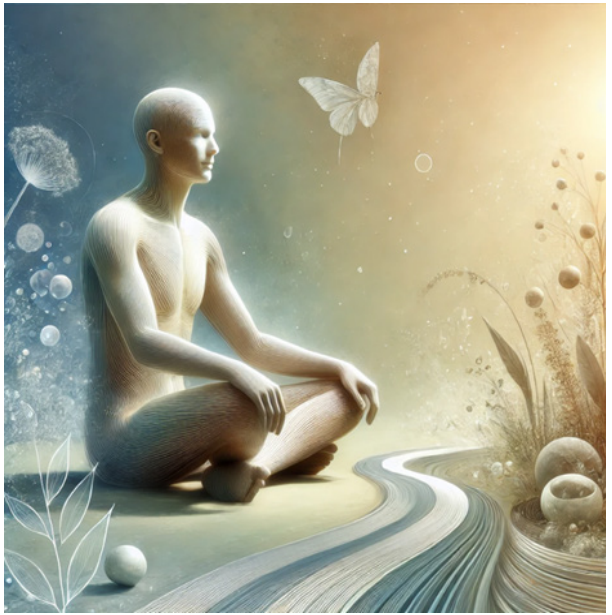
Figure 2. Artistic representation created by Dall-e representing a man who underwent successful headache treatment.

"Here is an artistic representation of a person undergoing successful treatment for a headache, depicted in a serene and calm environment. The image conveys a sense of tranquility and relief." (Figure 2).