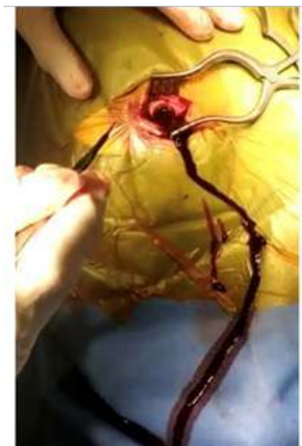
Figure 2. Chronic subdural hematoma drainage through a burr hole and exit through the orifice with high pressure of hematic material typically dark in color like petroleum.

In Figure 2 can be seen the chronic subdural hematoma drainage through a burr hole and exit through the orifice with high pressure of hematic material typically dark in color like petroleum. After drainage, the headache improved.