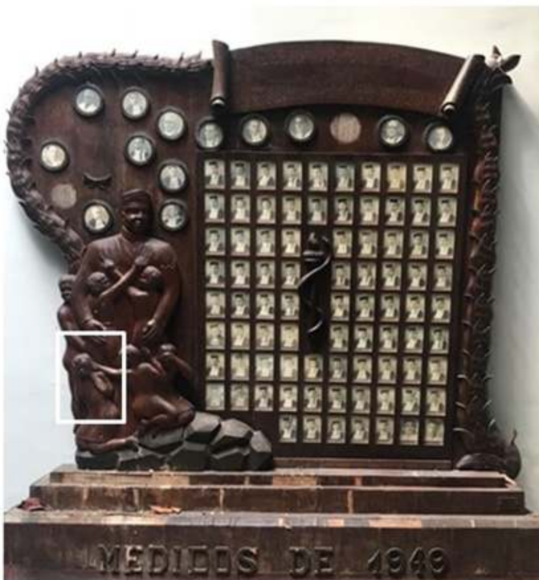
Figure 2. The wooden sculpture is part of a graduation photography for the 1949 medical class at the Faculdade de Medicina do Recife , Brazil. The part of the sculpture used on the front cover is shown with a frame.

In the current edition, the illustration was done by Beatriz Guerra, an 11-year-old girl who took the initiative to ask her classmates at school about the occurrence of headaches. We realized with the three images that the idea of evolution of a migraine attack, with the prodromal period, perhaps with a certain pallor (an autonomic disturbance), followed by a visual aura and later the headache, which is in the frontal region. This is the interpretation of a migraine crisis visualized by this preadolescent girl. It clearly shows that migraine is not just an adult problem and that specialists should guide mothers, fathers, and young children about headaches and available preventive and acute treatment forms. Figure 3 shows some of our published front covers, which have illustrated selected images representing works of art (e.g., drawing, painting, and sculpture).