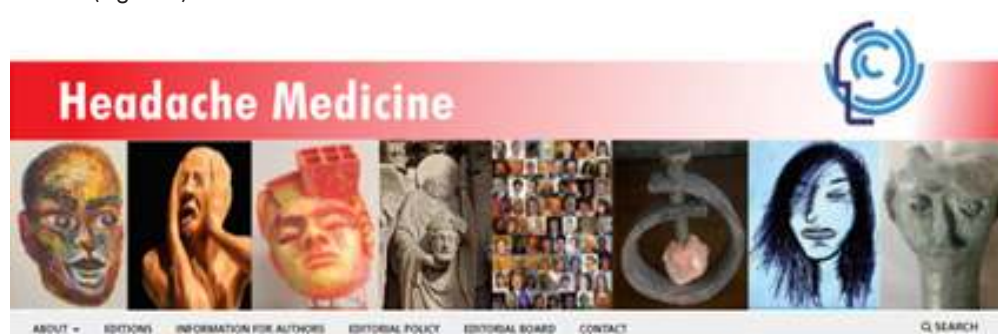
Figure 1. New layout of Headache Medicine website, updated in March, 2021.

As a way of praising the work of some artists and their respective work, we have placed some illustrations shown in previous issues of the journal on the home page of the Headache Medicine website (Figure 1).