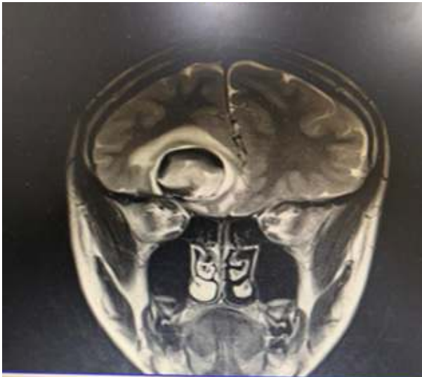
Figure 2. Magnetic resonance imaging of the brain showing Zabramski cavernoma 1.