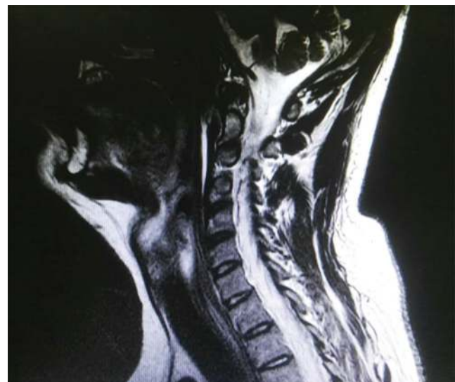
Figure 2. Magnetic resonance of the cervical spine: hypersignal in T2 at the back of C1, C2 and C3.

paresthesia and hypoesthesia in the left ear and left cervical region. Denied having a fever. When examined, the patient showed limited neck movement in all directions and hypoesthesia in the left cervical region. Initially submitted to a computed tomography of the cervical spine that showed hyperdensity at the back of C1 and C2 cervical processes. A magnetic resonance of the cervical spine was then requested, which showed a hypersignal in T2 at the back of vertebrae C1, C2 and C3, compatible with edema of the longus colli muscle (Figure 2). The patient was treated with corticosteroids (prednisone) for seven days but did not return for follow-up.