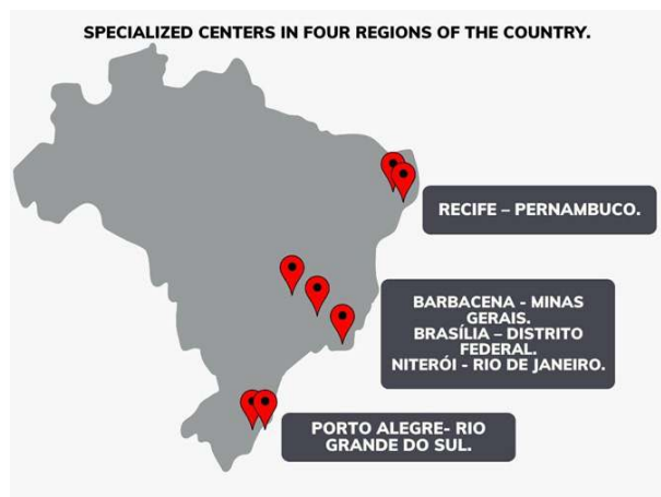
Figure 1. Specialized centers in four regions of the country.